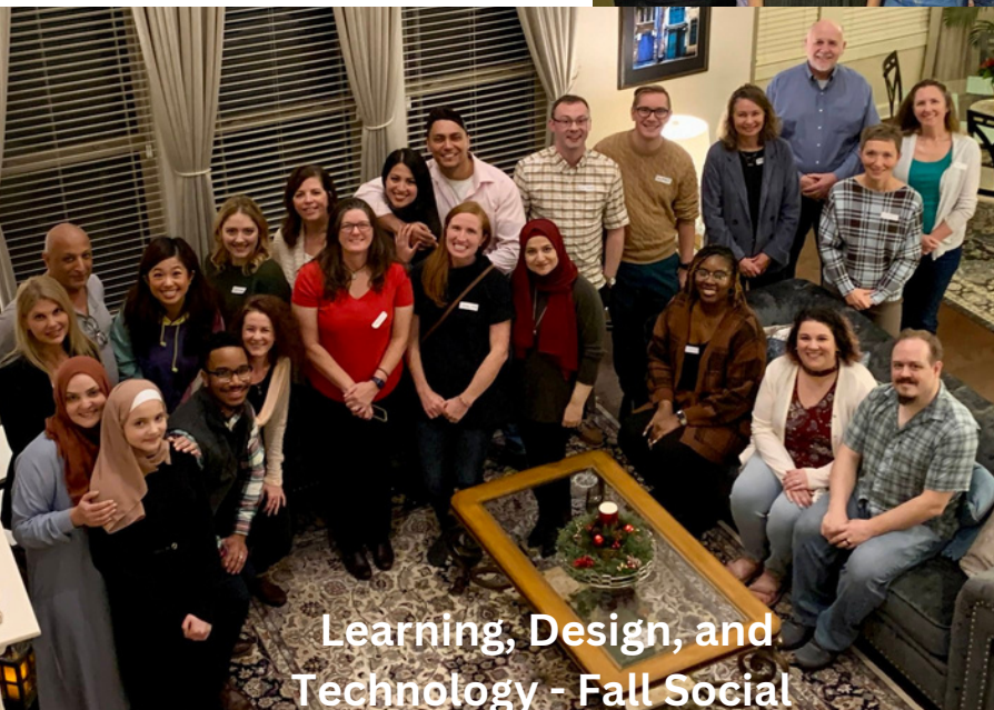
Learning, Design, and Technology - Fall Social