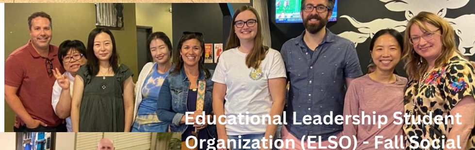
Educational Leadership Student Organization (ELSO) - Fall Social