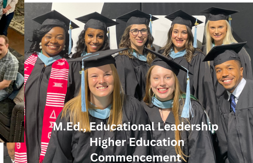
M.Ed., Educational Leadership Higher Education Commencement