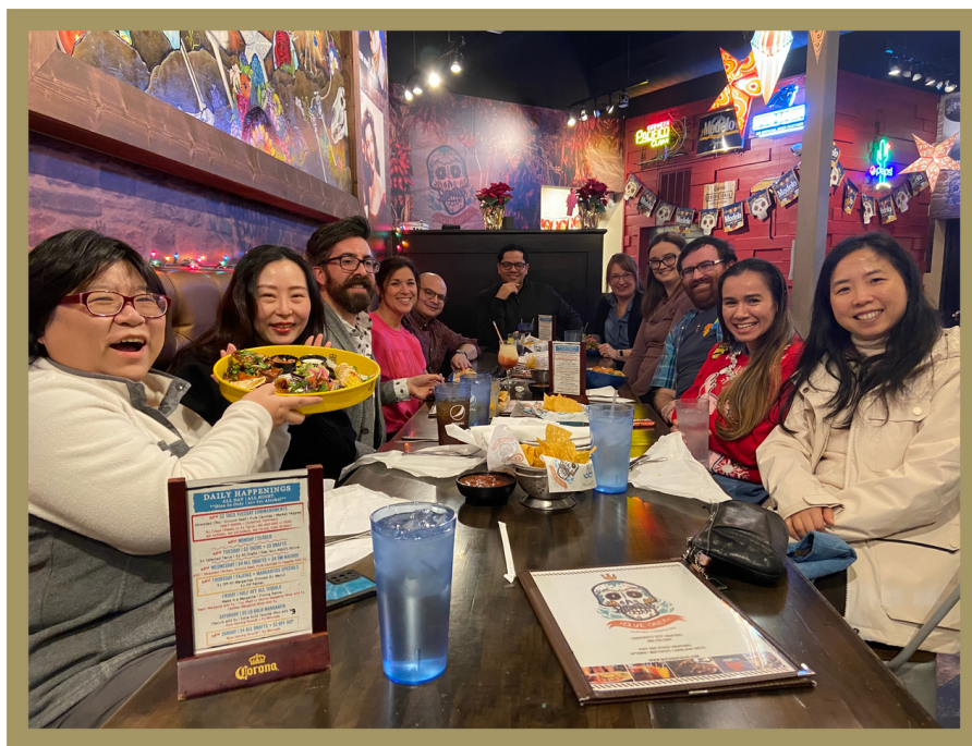
ELSO End-Of-Semester Celebration Trivia Night at Que Onda Tacos *2nd Place Winners of Trivia Night*