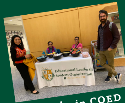
Snacks in COED